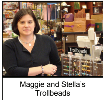
Maggie and Stella's Trollbeads

In addition to new merchandise arriving throughout the holiday season, Maggie and Stella's Cards and Gifts (209 Oakland Ave.) will be unveiling their new Trollbeads jewelry line with a Trollbead Trunk show on