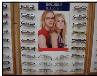
Some of Medical Center Optician's glasses selection

Underground Printing (117 Meyran Ave.) is offering students a $5 student T-shirt deal when at least 50, one-color front shirts are ordered.