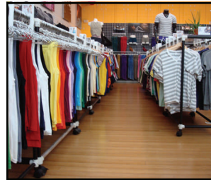
American Apparel's colorful collection

For that unique pair of colorful jeans or the most comfortable shirt ever made, stop by American Apparel (3805 Forbes Ave.) .