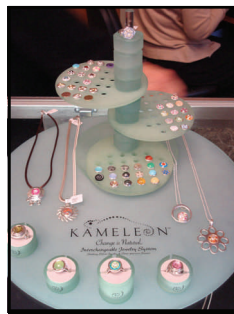
Touch of Gold and Silver's Kameleon jewelry

Touch of Gold and Silver (3800 Forbes Ave.) is introducing their Kameleon line of jewelry along with new merchandise arriving daily. Keep a look out for their Friends and Family event in which OBID members will receive a special discount. Touch of Gold and Silver also participates in UPMC's Perks program in which UPMC employees receive a discount when shopping at participating stores.