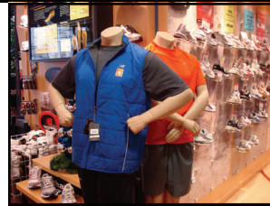
New Balance's Apparel Collection

by New Balance Pittsburgh (3810 Forbes Ave.) to take advantage of 30% off of the New Balance Apparel collection.