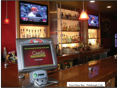
First Floor Bar- Pittsburgh Café