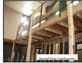
Second Floor Construction

creation of a second deck that will lie above the existing first floor deck. Finally, the fourth stage will be the construction of a full kitchen in the basement. Pittsburgh Café will expand the menu to offer everything from appetizers to veal chops and steaks.